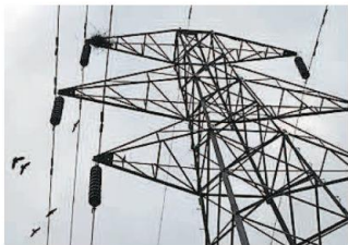
The pylons would be built in the Stour Valley

A row over plans to put electricity pylons in the picturesque Stour Valley has taken a twist – after a minister backed campaigners’ concerns.